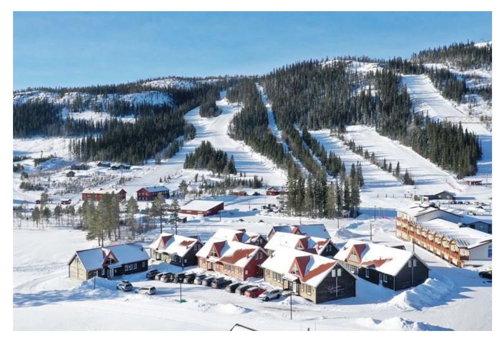
Skistar Lodge Solviken, Klövsjö